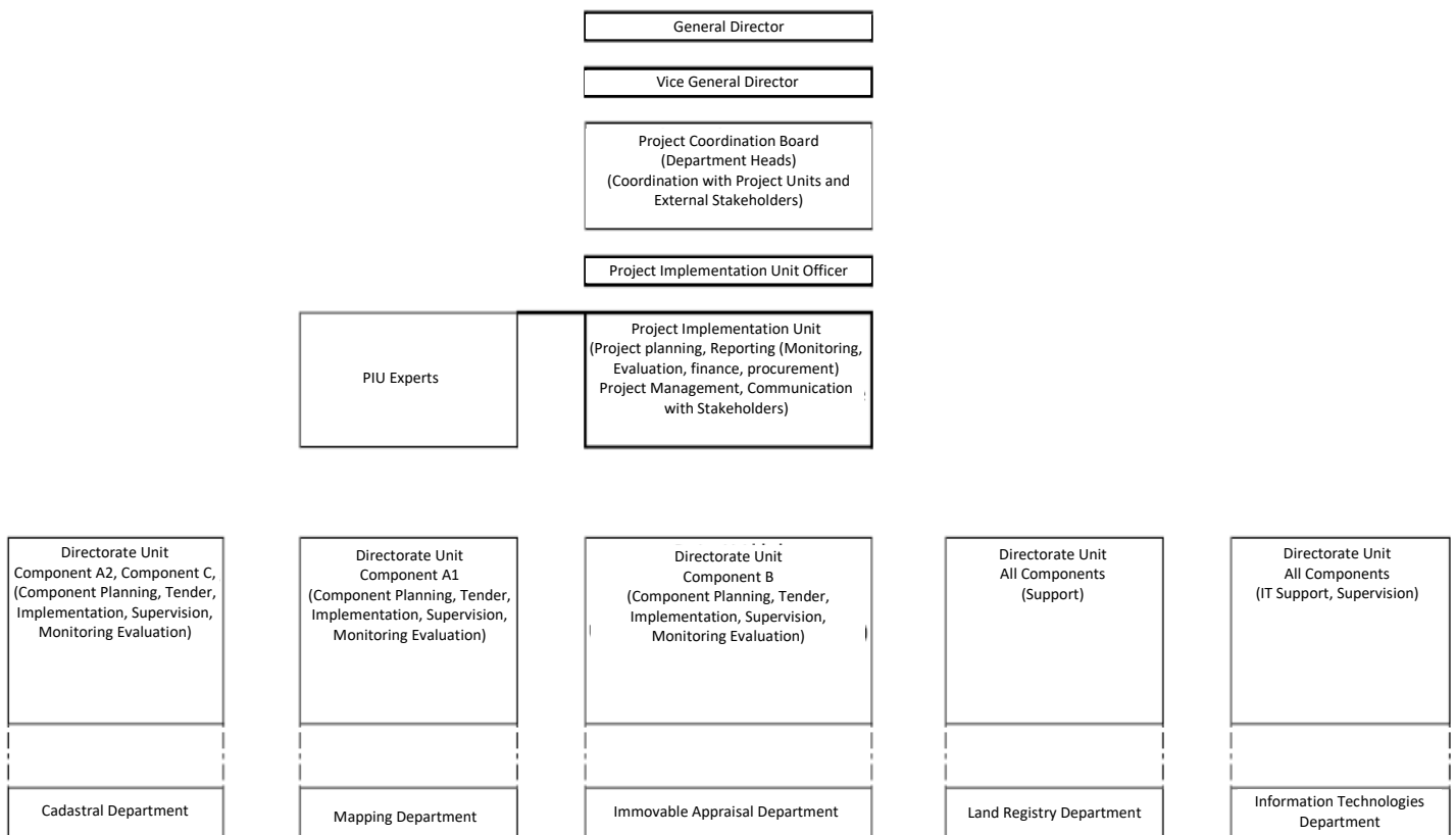
Figure 1. Main ESF responsibilities in PIU and PCU

The Environmental&Social specialist within the PIU shall be the responsible party for the implementation of Stakeholder Engagement Plans (SEP) and communication with communities throughout the project.