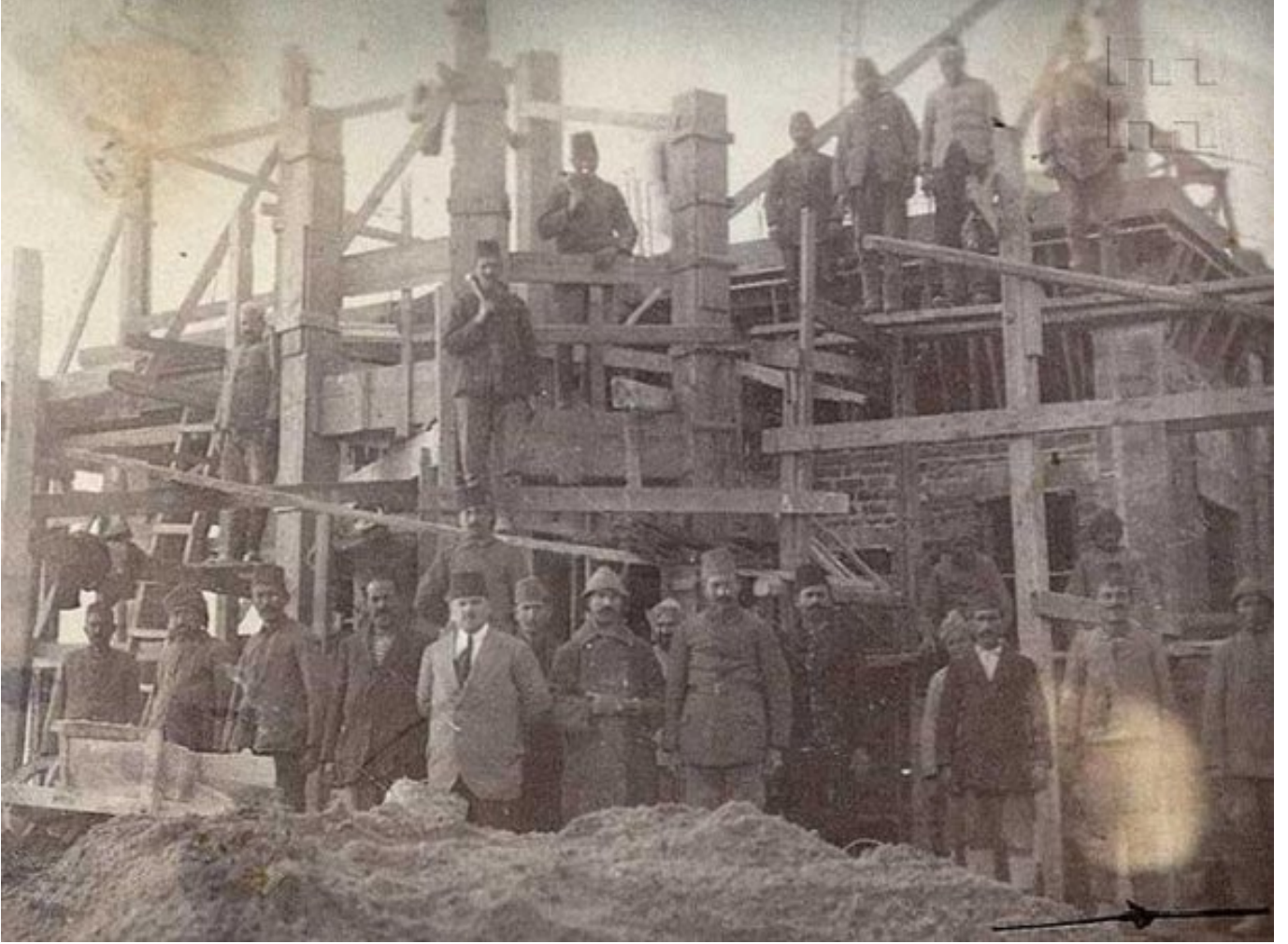
The Construction of DeFTER-i Hakani - (1908) *